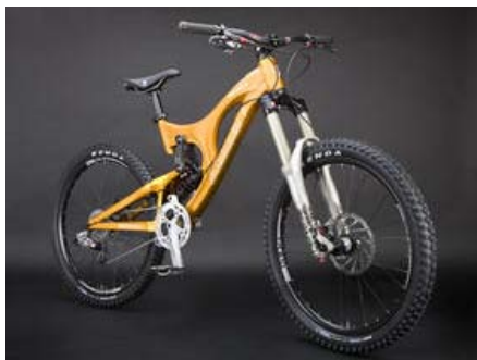
Santa Cruz debuts its latest gravity model, the Driver 8.

As with all of Santa Cruz's recent introductions, the Driver 8 will feature second-generation Virtual Pivot Point (VPP) suspension architecture, which Santa Cruz says offers more usable travel throughout the range and decreased chain growth to minimize kickback. The massive aluminum lower link sports eight angular contact cartridge bearings, an integrated grease port, and a combination of contact and labyrinth seals for increased side load capacity and extended service intervals. The new carbon upper link is fitted with four radial contact bearings.